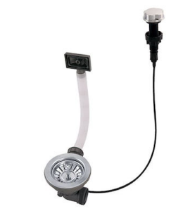
Automatic waste fitting 8407 100